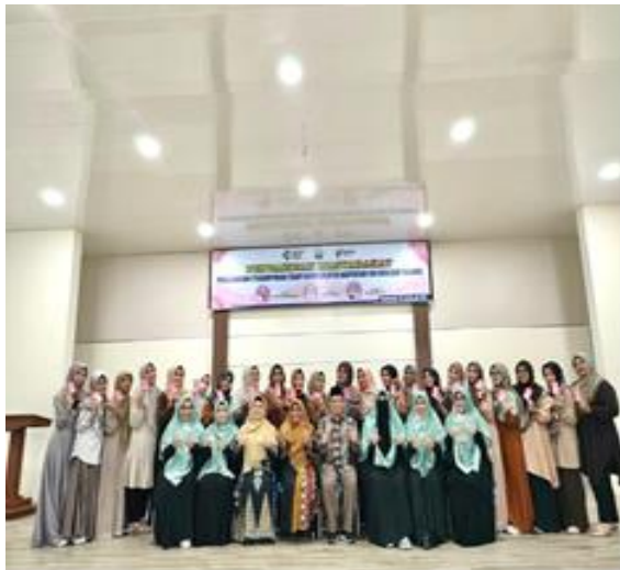
The Acupressure Training Activity was Opened by the Director of the Poltekkes of the Aceh Ministry of Health.

Community service is carried out in the City of Banda Aceh and Aceh Besar District. the target of the service is 20 alumni majoring in midwifery consisting of D-III Midwifery Study Program alumni and D-IV Midwifery study program alumni from the Aceh Ministry of Health Poltekkes. This activity consists of training activities and accompaniment activities of complementary acupressure therapy. Acupressure complementary therapy training activities were carried out for 3 days, from 01 to 03 July 2022 in the Hall of the midwifery department of the Aceh Ministry of Health Polytechnic.