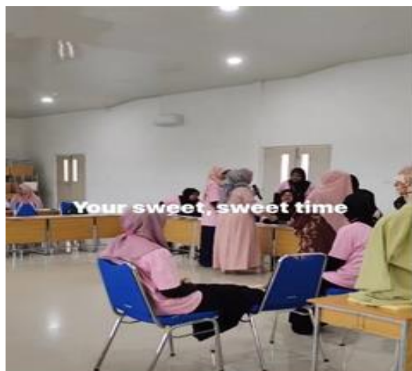
Demonstration of Acupressure Complementary Therapy Practices