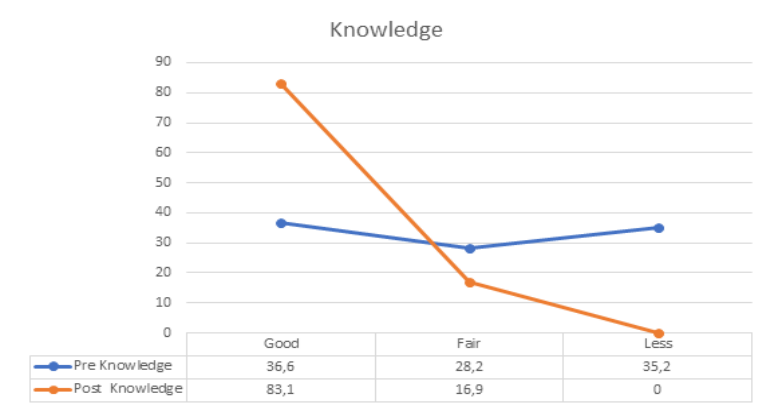
Graph 1. Knowledge pre test-post test results

Graph 1. It is known that in the good category, the pre-test results obtained a frequency of 36.6% and the post-test results showed a percentage increase of 46.5% to 83.1%. In the moderate category, a decrease in percentage was obtained from 28.2% to 16.9%. While for the category shows a decrease of 35.2%.